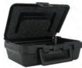
Protective Carrying Case