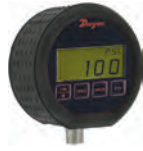
DPG-100 with Protective Rubber Boot