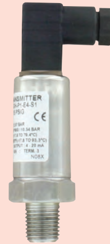
General Purpose Housing (-GH) with DIN C