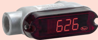
626 with LED Display (CH housing only)