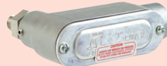
Conduit Housing (-CH)

*Please see our website for dimensional drawings.