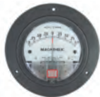
Flush, Surface or Pipe Mounted